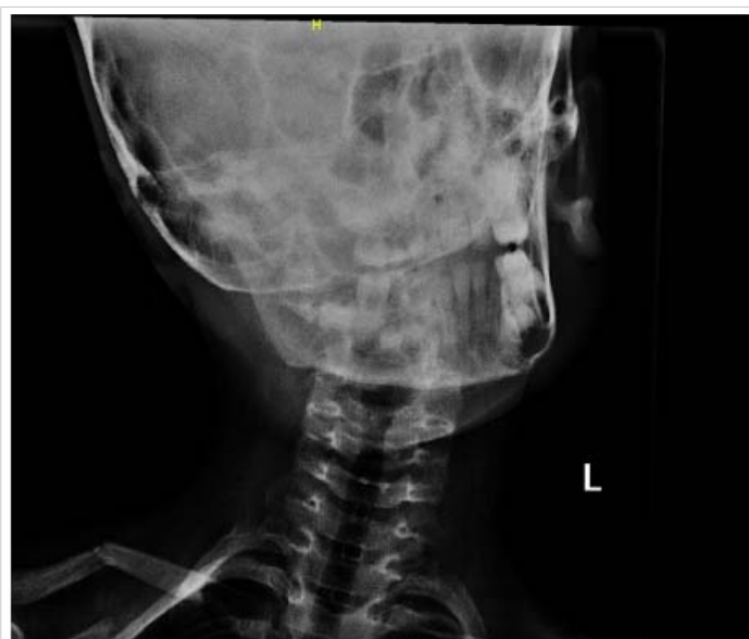
Figure 2: Image of cervical x-ray of patient upon presentation to ER. While read as unremarkable except for a fractured clavicle during the time, it is quite clear that AAS is present, as indicated by the quite prominent “Cock Robin” head position displayed above.

Despite application of the cervical orthosis, the following day, the “Cock Robin” head position recurred. After three attempts and recurrent subluxation, the patient underwent halo traction. Once cervical spine x-rays demonstrated C1-C2 alignment, a halo vest placement was performed. Follow-up CT demonstrated improved alignment. After halo vest immobilization was maintained for three months, a hard collar was worn for two months followed by a soft collar. Neck strengthening with physical therapy was recommended. Follow-up radiographs performed five and nine months after the trauma confirmed proper cervical spine alignment.