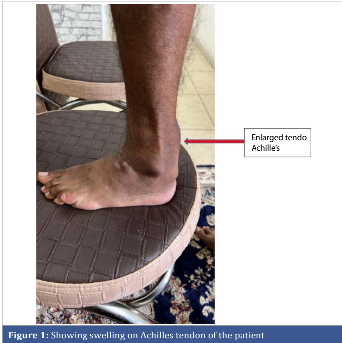
Figure 1: Showing swelling on Achilles tendon of the patient

dL, HDL cholesterol 70 mg/dL, LDL cholesterol 106 mg/dL, non-HDL cholesterol 104 mg/dL, VLDL 20.7 mg/dL. Acid steroids and bile alcohols in urine could not be evaluated. A serum cholesterol test also could not be done.